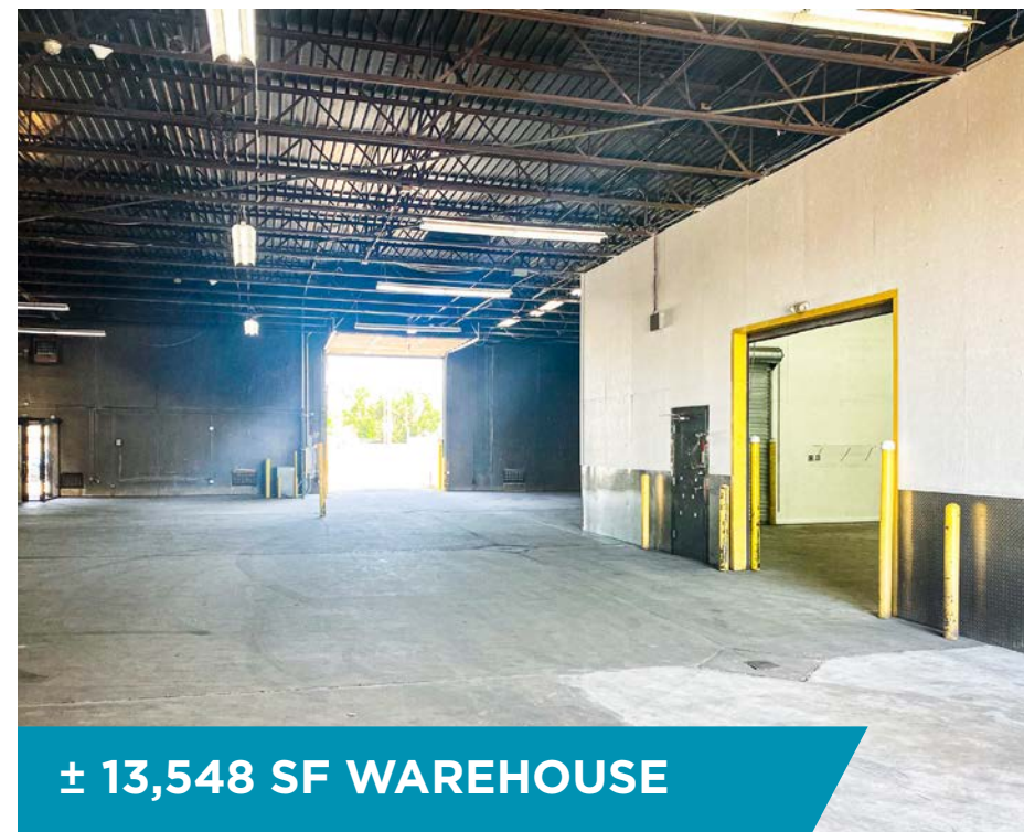
± 13,548 SF WAREHOUSE