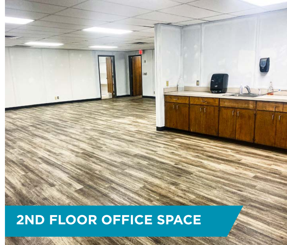
2ND FLOOR OFFICE SPACE